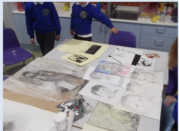
Different Art workshops that children took part in

Please come and view your child's artwork from 2.50pm on Friday 19th October in their classrooms.